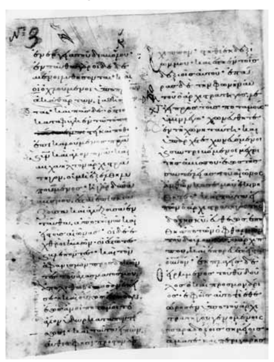
2 Serd. BAS gr. 3, fol. 1<sup>r</sup> (ca. 65 %)